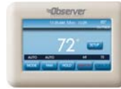
TSTAT0201CW (Sold Separately)

* For residential applications only. See Warranty certificate for complete details and restrictions, including warranty coverage for other applications.