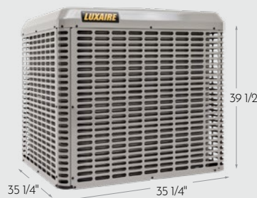
Traditional vertical discharge A/C