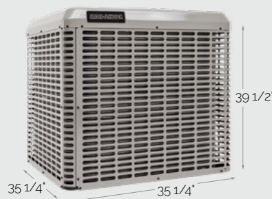
Traditional vertical discharge A/C