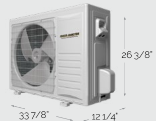
HMCG2 Horizontal Discharge A/C