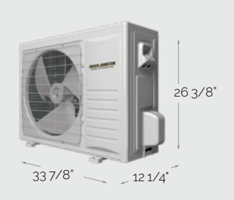
HMCG2 Horizontal Discharge A/C