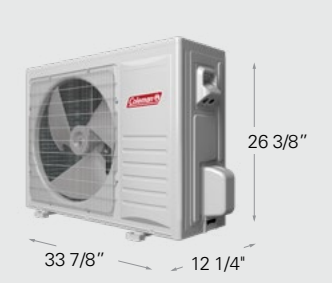
HMCG2 Horizontal Discharge A/C