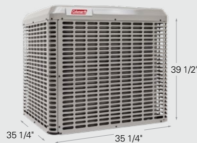
Traditional vertical discharge A/C