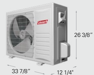
HMCG2 Horizontal Discharge A/C