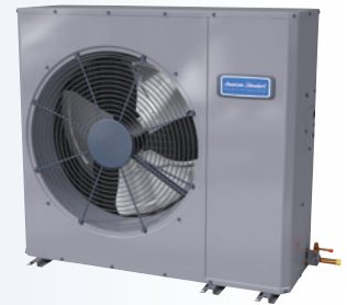
Platinum 19 Low Profile