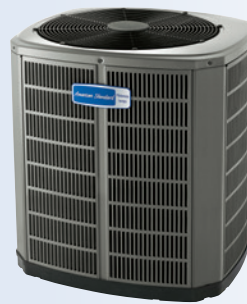
AccuComfort™ Platinum 18