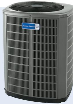
AccuComfort™ Platinum 20

Our most efficient and powerful heat pumps. Enjoy the highest level of comfort and maximum efficiency with features like Duration™ variable speed compressors, Spine Fin™ coils and copper tube coils.*