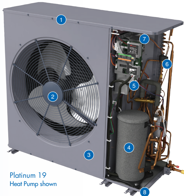
Platinum 19 Heat Pump shown

**Platinum 20/Platinum 18/Platinum 19 vary speed in 1/10 of 1% increments.