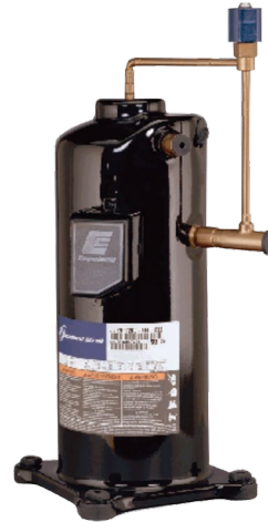
Variable capacity scroll compressors provide load matching cooling and heat pump heating and improve part load efficiency.