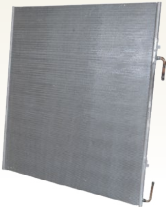
Microchannel condenser coils are more efficient, lighter, and use less refrigerant than traditional fin and tube condenser coils.

AAON LF Series chillers are designed for premium performance and superior serviceability. The chiller can be provided with factory engineered and installed pumping packages, eliminating the need for a mechanical room. For improved part load efficiency and consistent leaving water temperature, LF Series chillers are available with variable capacity scroll compressors. Each LF Series chiller is factory tested to ensure proper operation once installed.