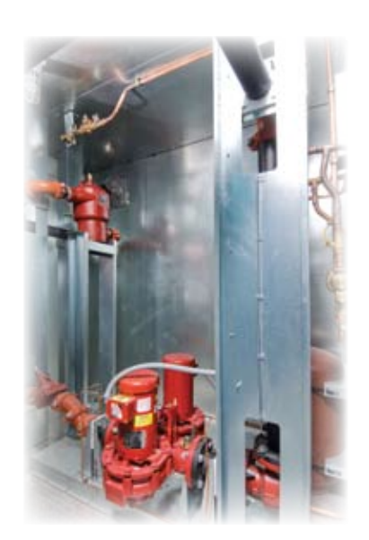
Factory Installed Boiler Building Pump