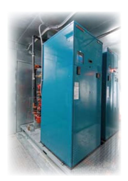
Factory Installed Boiler

The BL Series boiler's design includes the very best of existing copper tube and copper-finned boiler technology and incorporates features and benefits not found in other boilers. Designed to operate at 88% thermal efficiency with \mathrm{NO_x} ratings less than 9.9 ppm, the boilers noiseless ceramic radiant burner runs at minimal excess air levels, creating highly efficient trouble free operation. An innovative gasketless carbon steel header provides for easy inspection, cleaning, and individual tube replacement. The combustion chamber is also completely enclosed in a stainless steel compartment and features collection/evaporation components to effectively handle cold-start condensate. Boiler heating modulation, from 10 to 100%, is achieved using a VFD to control combustion air and an air-fuel ratio modulating gas valve. The boiler's electrical spark-to-pilot ignition utilizes a UV scanner to prove pilot before main gas valves open, giving the boiler a much more reliable proof of pilot than hot surface ignition systems.